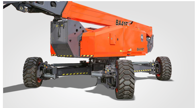
Brand New One-Key In-Situ Axle Expansion Technology Global Patent Protection