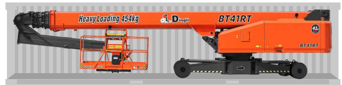
Standard Container Transport